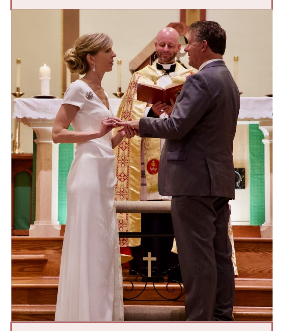
St. Jude of the Lake Catholic Church